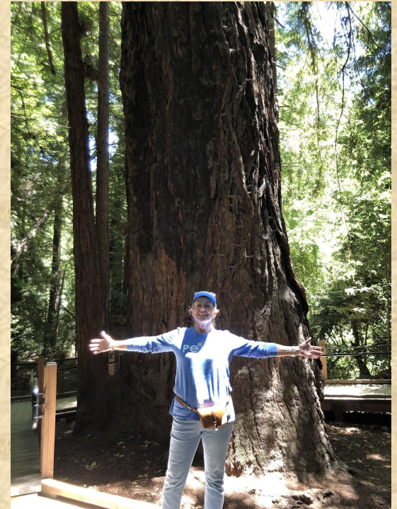
Big Sur July 2022

Both of my children graduated from JMHS. I am also the grandmother of two cute grandbabies! I love to travel and golf when time allows, and I'm looking forward to my daughter's upcoming wedding. I'm looking forward to getting to know your child better and having a fantastic year!